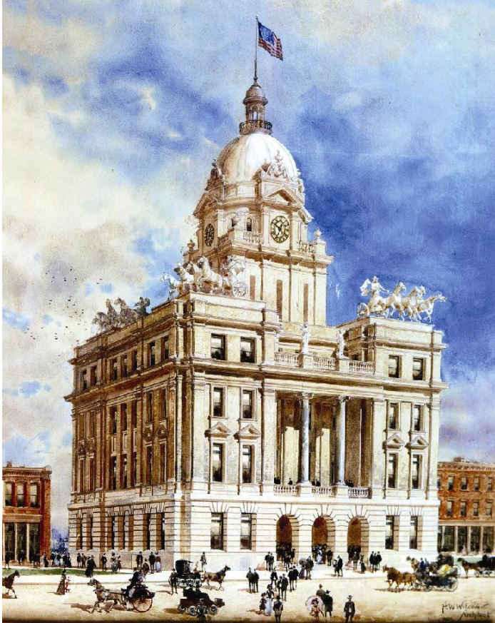
The image on the left is the original watercolor design of City Hall painted by the architect, Hyman Wallace Witcover, in 1904.

CIRCLE THE DIFFERENCES BETWEEN THE TWO PICTURES