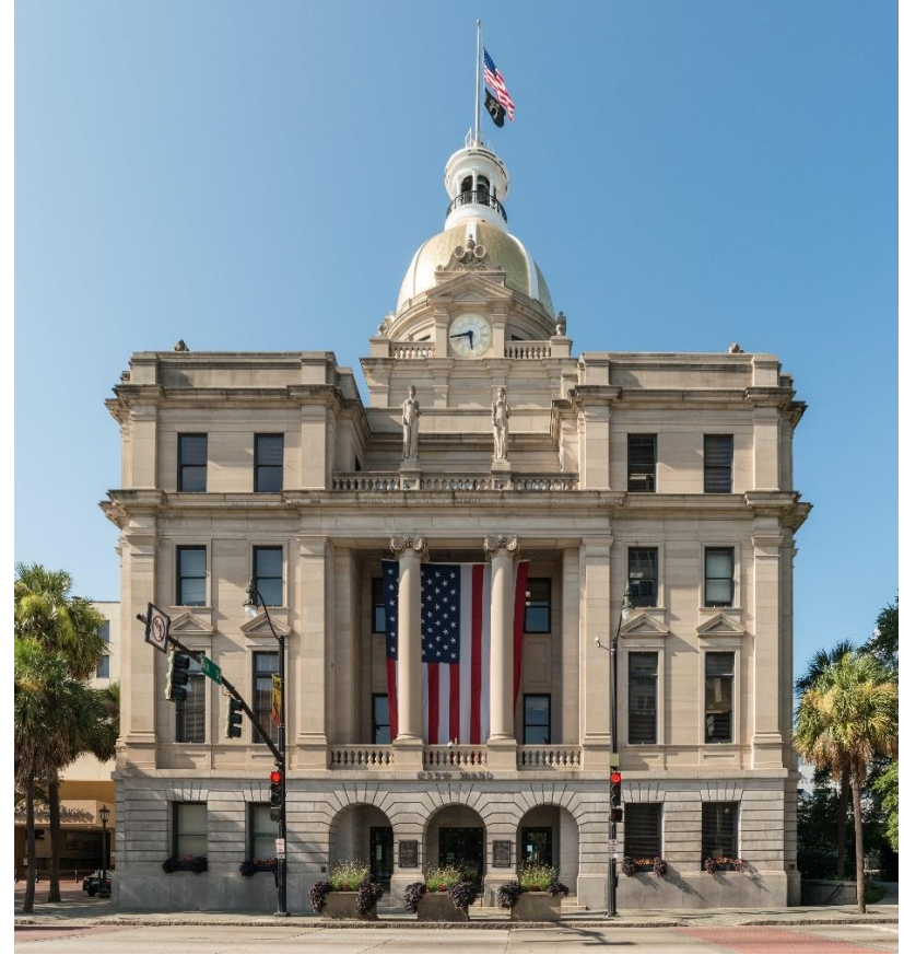
The image on the right is a modern photograph of City Hall.