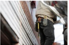
Savannah Business Opportunity Program