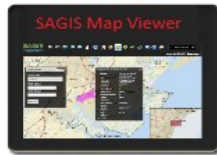
Area Maps and Data