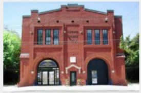
Savannah Entrepreneurial Center