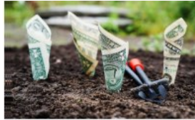
Access to Capital