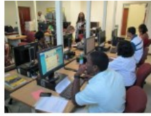
Business Education and Events