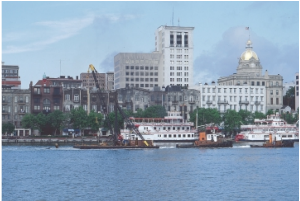
■ THE VIEW OF SAVANNAH'S RIVERFRONT HAS CHANGED CONSIDERABLY SINCE OGLETHORPE LANDED, BUT THE EMPHASIS ON HISTORICAL PRESERVATION IS APPARENT. CITY HALL CAN BE SEEN FROM THE TRADE CENTER AND RESORT, JUST THREE MINUTES BY FERRY ACROSS THE SAVANNAH RIVER.

Today, Oglethorpe's bluff is filled with colorful pubs, shops, and restaurants. Across the waterfront, an enormous trade center casts an impressive reflection in the busy Savannah River, reminding Savannahians of all cultures that careful planning, combined with progressive leadership, lead to a city filled with prosperity. 🌿