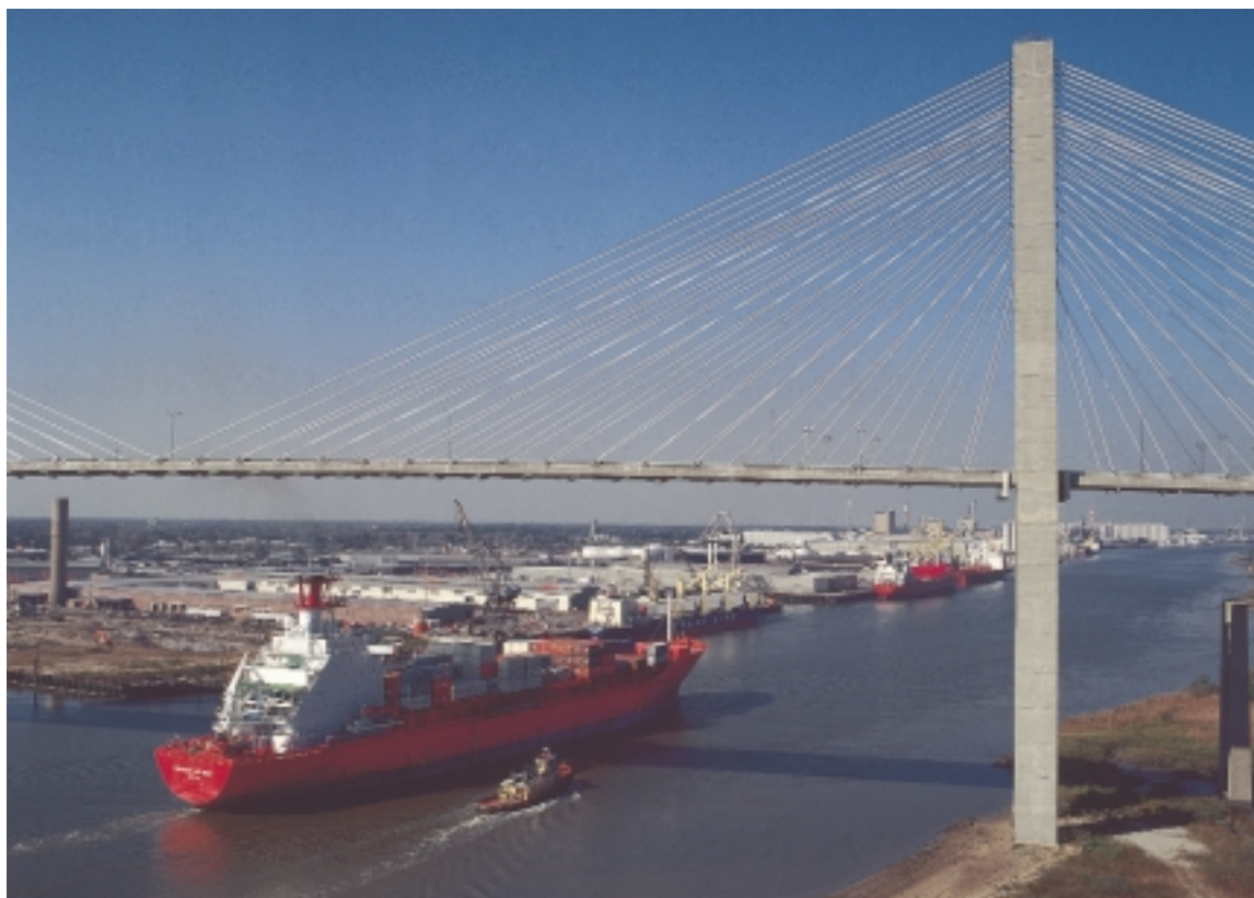
■ AS TOURISTS LOOK ON, MILLIONS OF TONS OF CARGO PASS RIGHT THROUGH SAVANNAH'S HISTORIC DISTRICT, ON THE WAY TO THE SAVANNAH PORT, ONE OF THE BUSIEST AND MOST MODERN PORTS IN THE SOUTHEAST.