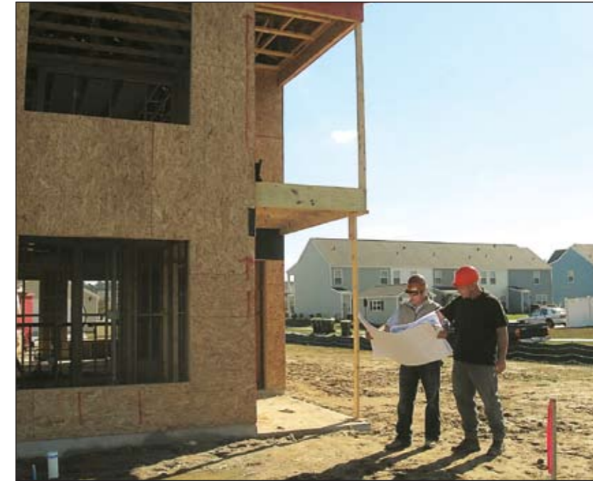
City building inspectors save lives by ensuring structures are built to code.

Community Development Initiative • $377,897 Community Planning and Development will provide street-level penetration into targeted Community Development Block Grant (CDBG) neighborhoods to engage low-income residents in the assessment of programs and conditions; planning/