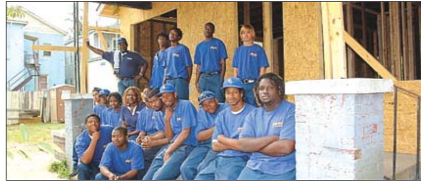
The YouthBuild Program teaches young citizens construction skills while adding needed affordable housing.

Design and Construction Services • $647,217 Quality facilities are intrinsic to citizens' definition of quality of life. This service