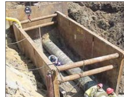
Savannah has invested $150 million since 1994 to decrease the threat of floods.

Police Court Liaison • $89,068 • The Court liaison works to ensure officers are present