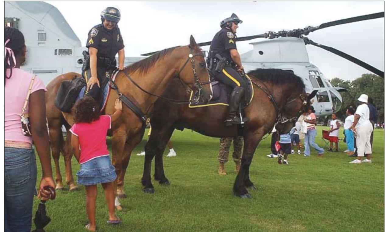
Metro's Mounted Patrol is one unit in a police force that reduced Part I crime by 6 percent in 2009.

CrimeStoppers • $227,429 • CrimeStoppers of Savannah/Chatham County allows citizens to call, e-mail or text a crime tip anonymously in an effort to solve and/or prevent a crime. CrimeStoppers is an effective community, media and law enforcement tool that works together with