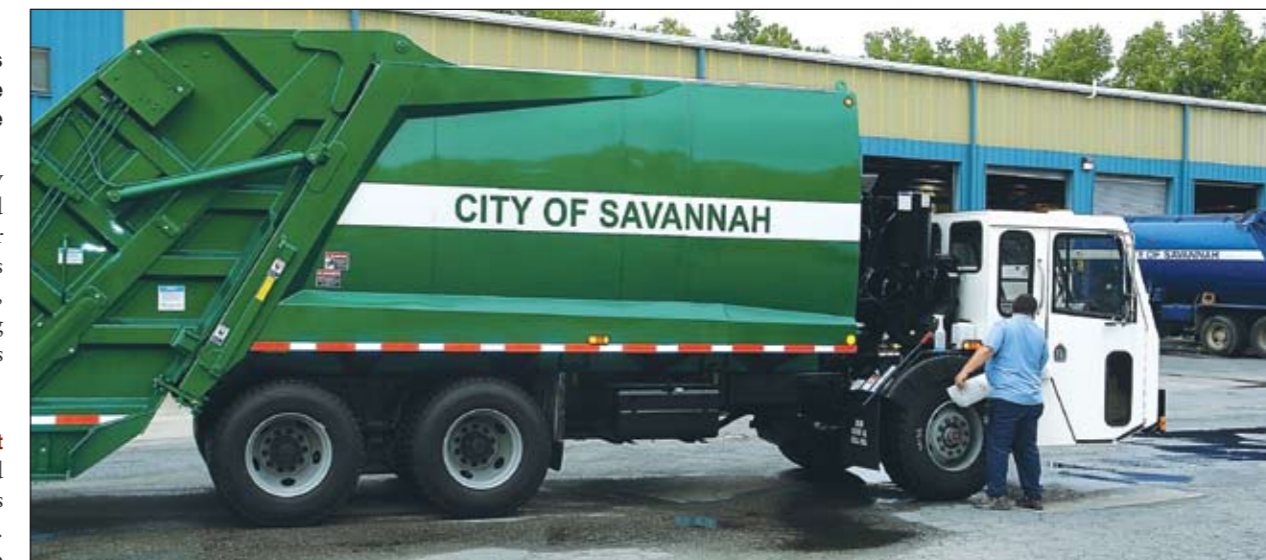
Savannah residents recycled more than 15 million pounds of trash during the first year of curbside recycling.

Savannah owns and operates approximately 860 miles of gravity sanitary sewer mains and force main infrastructure to collect and deliver wastewater and sewage from the citizens, businesses, industries and institutions in the City of Savannah and unincorporated Chatham County to the City Water Reclamation Plants for treatment.