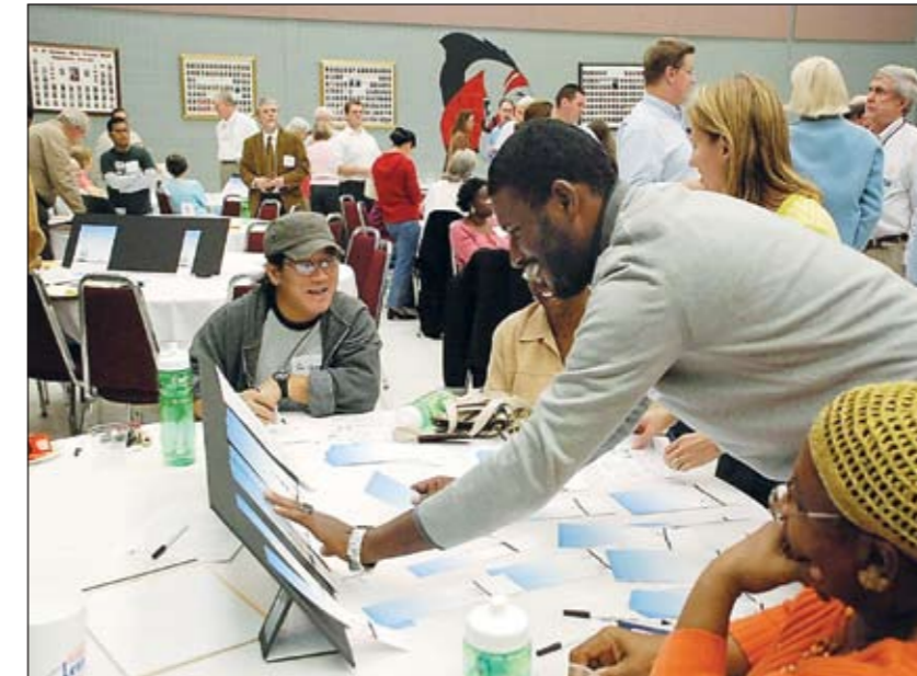
City Government works with citizens to create a better Savannah.

Management and Financial Services Leadership • $374,207 • This service fosters strong, accountable leadership throughout the organization, working across governmental and jurisdictional lines to create a better Savannah by: 1) Leading the M&FS Bureau; 2) Facilitating city-wide collaboration; and 3) Advocating for intergovernmental cooperation.