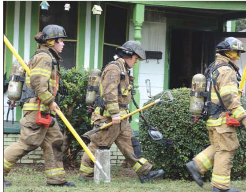
The 325 Savannah Fire employees comprise the most highly trained, best-equipped department in the region.

Fire Administration • $752,772 • Fire Administration is responsible for providing and maintaining adequate facilities to house emergency response personnel, their equipment, and apparatus used in safely and efficiently mitigating emergency events.