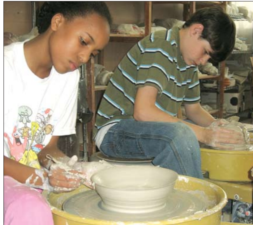
Savannah's Cultural Affairs Department offers an array of art classes for children and adults.

Adult Services • $683,224 • Adult athletic services include opportunities to improve physical fitness and education by using facilities and services to interact with individuals, promote healthy lifestyles, and strengthen communities by participating in sports leagues, or utilizing facilities that promote healthy lifestyles. Major adult