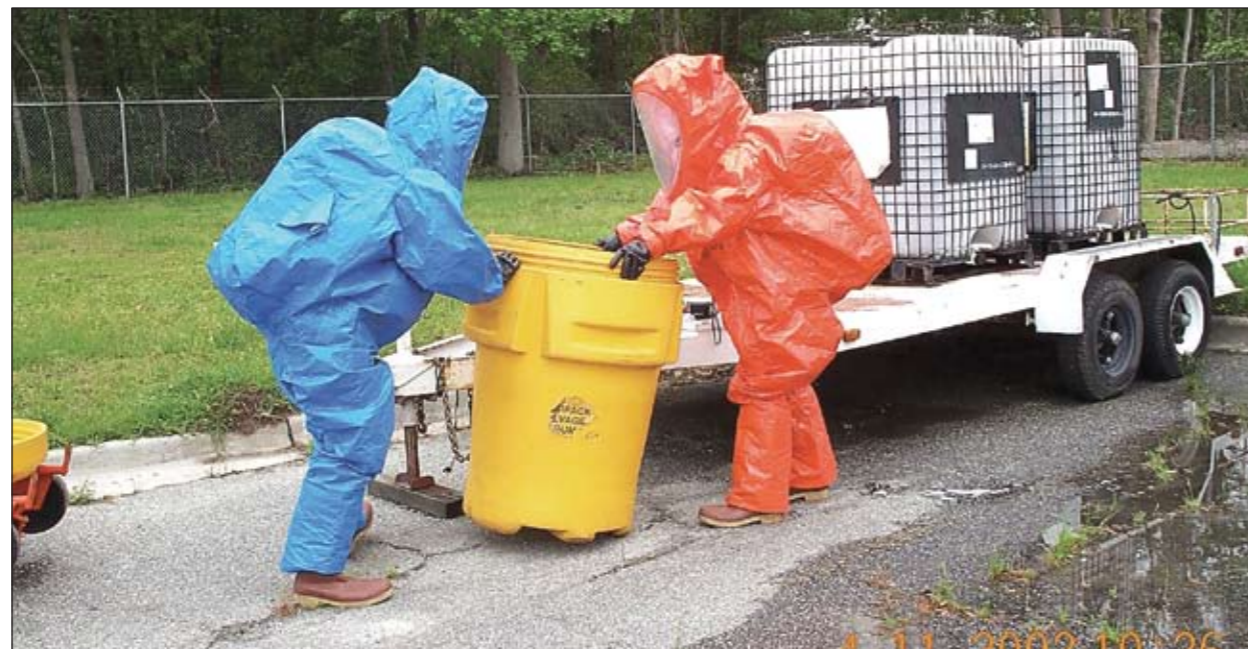
Savannah Fire's HazMat Team is the region's only hazardous materials response agency.

The Customer Service Desk helps make SCMPD a responsive and transparent governmental service. This is achieved through providing a variety of customer contact services as well as assisting internal