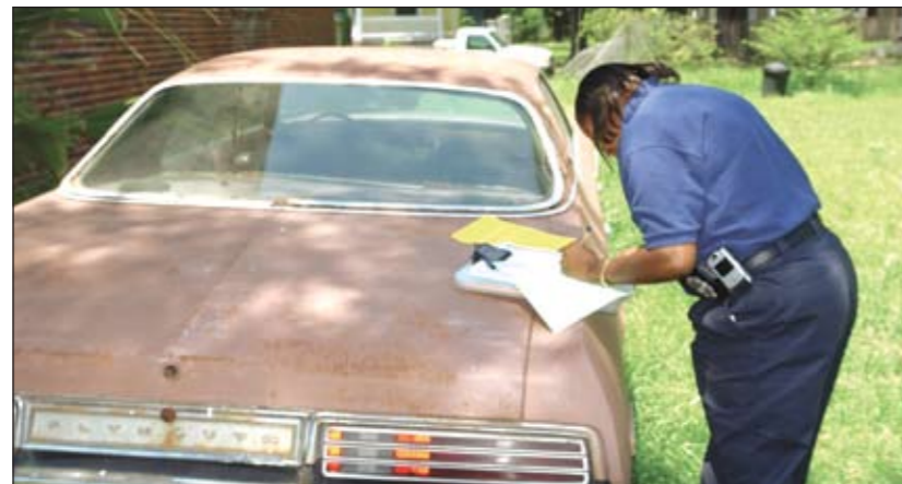
Savannah's Property Maintenance inspectors work to rid our neighborhoods of blighted structures and vehicles.

Development Permitting and Inspection $3,090,918 • This service is responsible for all development permitting, inspection services for all private development projects and all of the zoning enforcement in Savannah. Employees work to ensure that all construction meets code requirements, and that high standards of construction for the consumer and user are enforced.